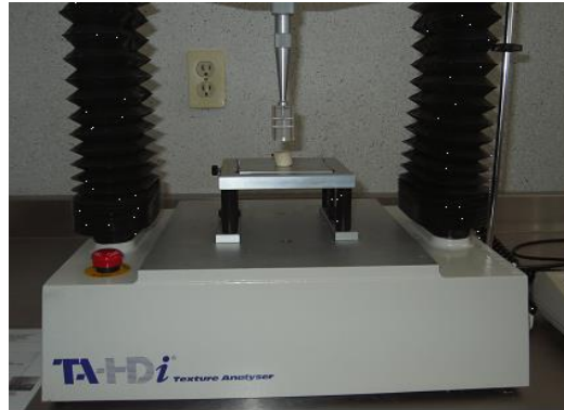
Figure 1. Texture Analyzer during determination

Figure 1 shows a Texture Analyser used for the mechanical test.