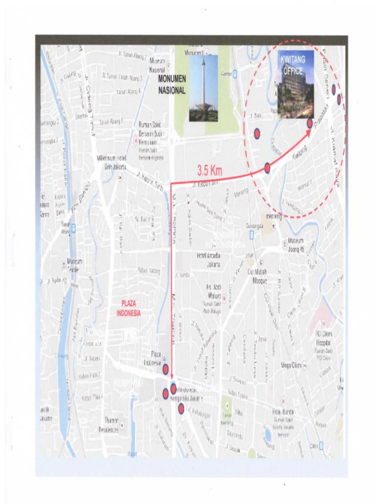
Figure 1 Location of study

development project management is carried out by each of technical, implementor, and designer management staff. Therefore, the data can be taken from every staff on project analysis level as well as management level. Location of study is as in Figure 1 below.