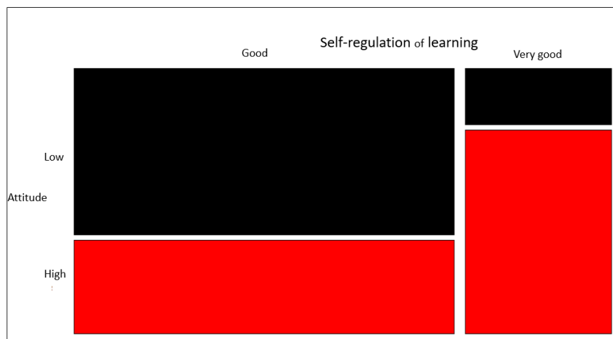
Figure 1 Graph of mosaics between self-regulation and student attitude

Next, Figure 1 shows the mosaic chart between self-regulation of learning and the variables age and student attitude.