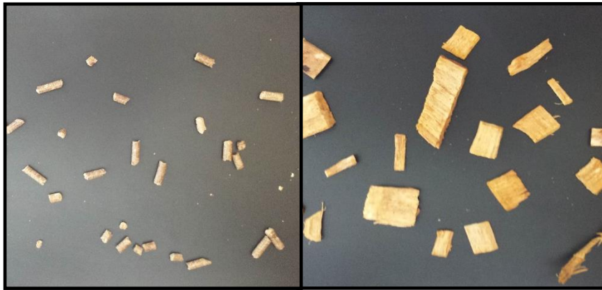
Figure 3 – Samples of the images acquire. On the left side wood pellet, on the right side wood chips coming from the Italian region Calabria.