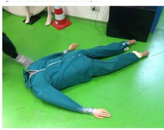
Figure 2: the dummy used for the experimental tests