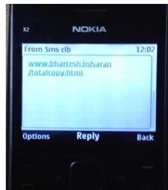
Figure (2) Overall system implementation.