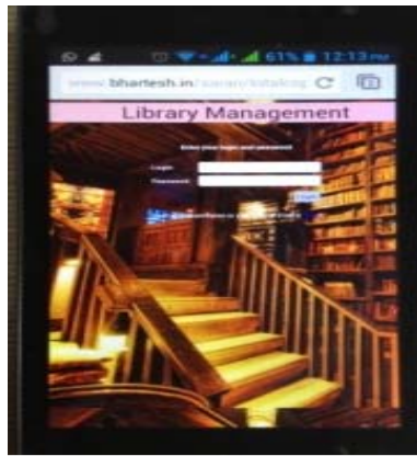
Figure (4) Home page of library website.

The software coding for creating library website web pages are written in HTML language and the connection between database and web pages are done by using PHP language. The SMS contains the smart library website link. If the student clicks the link, then it redirects to the homepage of the smart library website. The homepage has login options. Now, the student has gained the authority of accessing the digital library by providing the username and password of student details. Based on various requests, the server replies user with book details. The Figure(4) depicts the homepage of website and figure(5) states book details provided by the server with the user's preferences.